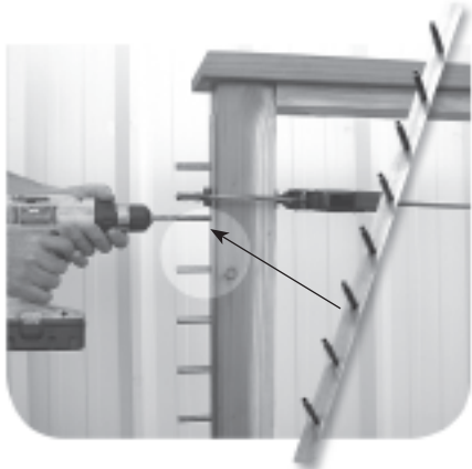
Contact factory for DRILL GUIDE ORDER FORM

Drill straight holes through your wood posts with a steel Drill Guide. Use the Drill Guide to drill your pilot holes. Subsequent drills will follow pilot holes. Clamp the guide to post and drill. It is best to drill one side, then the other. When ordering, allow space for clamps. A 6" overall-length drill is included that can also be used to drill your cable through holes.