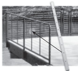
Contact factory for CABLE BRACE ORDER FORM

1/4" x 1" cable braces are used to support the cables between end or intermediate posts to keep the cable from flexing excessively when a load is applied. Cable braces are attached to the top rail and to the lower mounting surface, which can be a bottom rail or the deck. Available in mill finish carbon steel or #4 finish stainless steel.